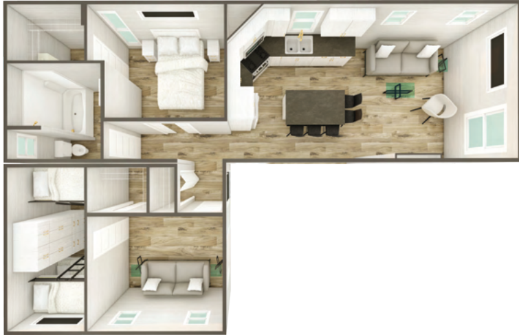
BDE 750-2RT 540 SQ.FT. + 247 SQ.FT.