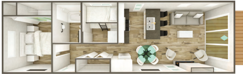
BDE 150-2RT 540 SQ.FT.