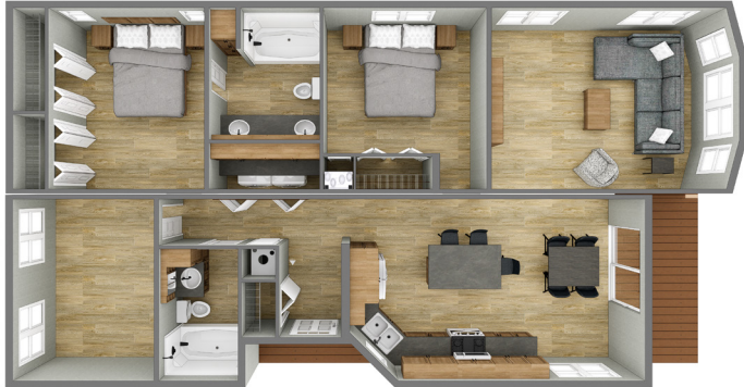
Princeton (P4613 + P4113) 1230 SQFT