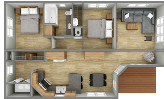
Paisley (P4212 + P4212) 972 SQFT