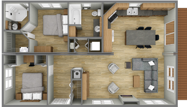
Prada (P4612 + P4612) 980 SQFT