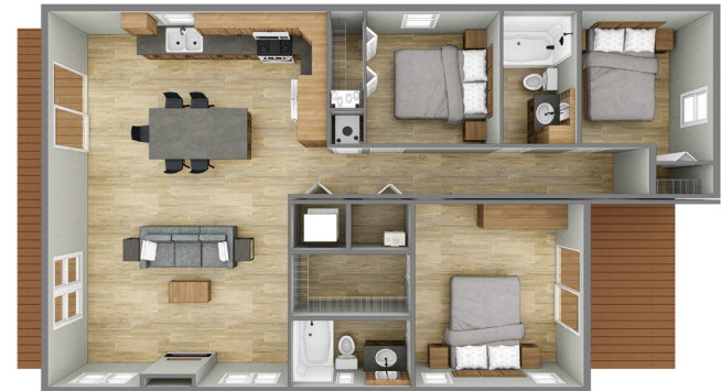
Paulista (P5113 + P5113) 1234 SQFT