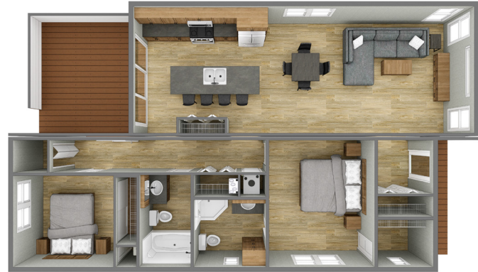
Pineridge (P4613 + P4613) 1004 SQFT