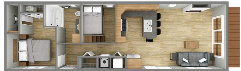
Paddington (P5114) 634 SQFT