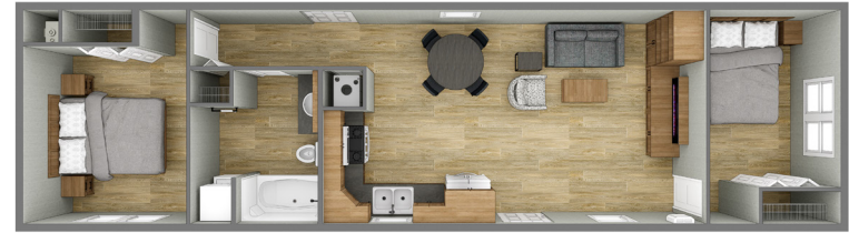
Pinecrest (P5114) 718 SQFT