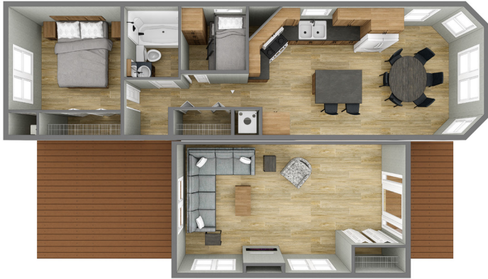
Pasadena (P4413 + P2213) 871 SQFT