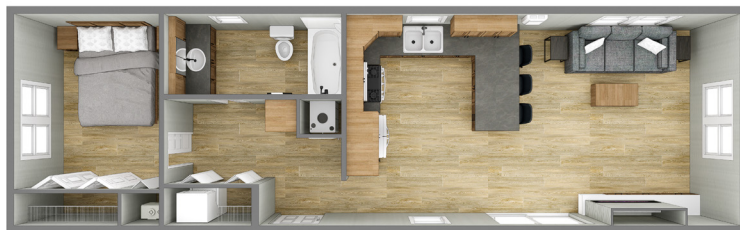
Parkdale (P4614) 648 SQFT