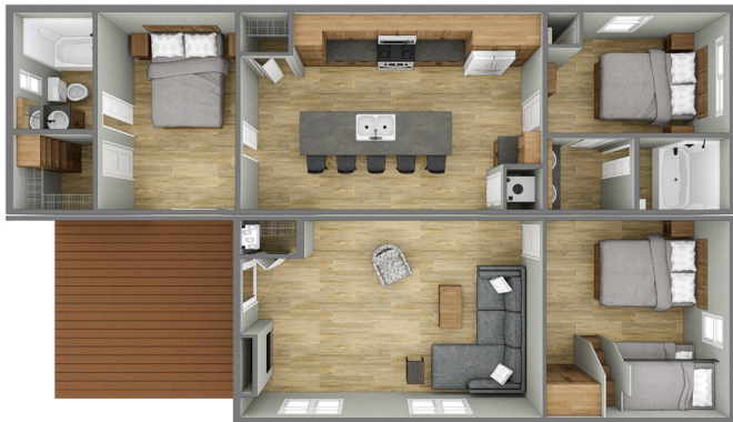
Ponoka (P4613 + P3113) 1023 SQFT