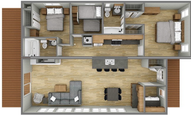
Pickworth (P4214 + P3614) 1086 SQFT