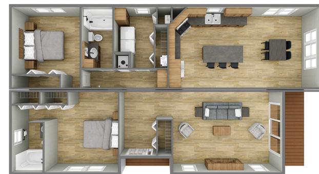
Prospect (P5114 + P4514) 1315 SQFT