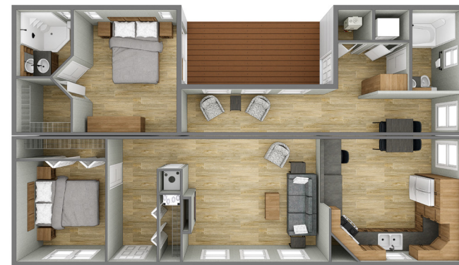
Pristina (P4612 + P4612) 1046 SQFT