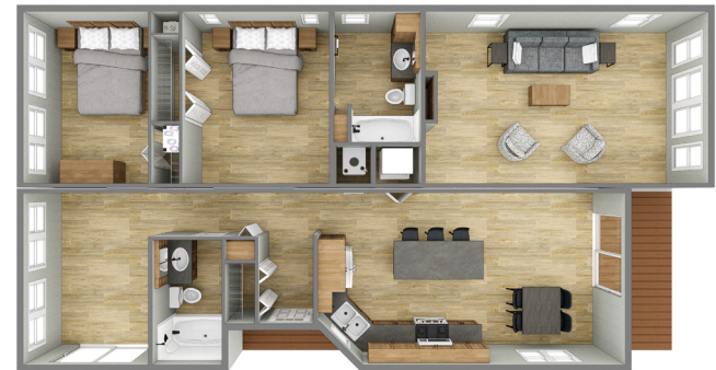
Prescott (P5013 + P4413) 1213 SQFT