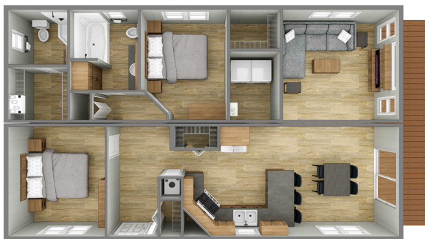
Paris (P4712 + P4712) 1005 SQFT