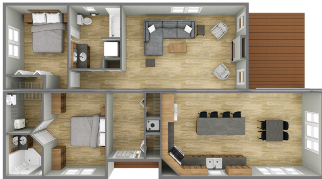
Peyton (P5114 + P3914) 1235 SQFT