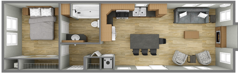
Portage (P4413) 580 SQFT