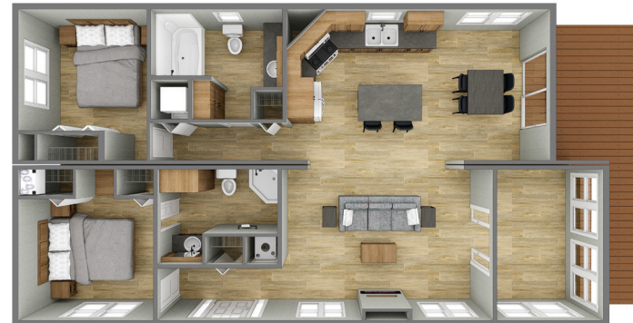
Parkview (P5112 + P4112) 1046 SQFT