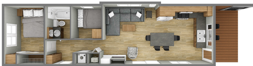
Pateley (P5113) 580 SQFT