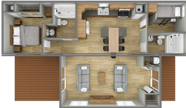
Penetangore (P4212 + P2312) 790 SQFT