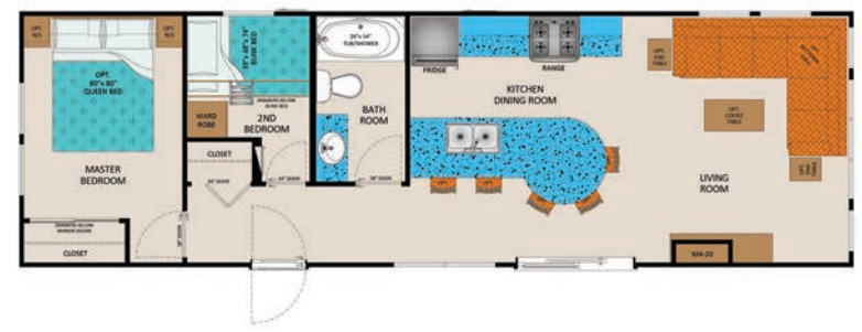
Marriott - 20 (M4213 2BR) 539 SQ.FT.