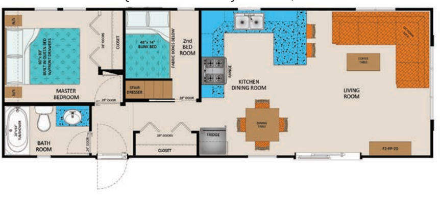
Fonthill - 20 (F3714 2BR CK) 502 SQ.FT.