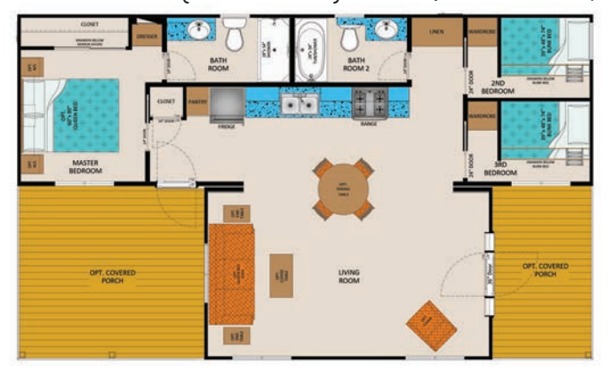
Mattawa - 20 (M4012 3BR) 474 SQ.FT. + 237 SQ.FT.