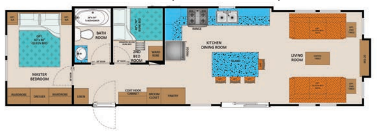
Manchester 2 - 20 (M4512 2BR FL) 539.5 SQ.FT.