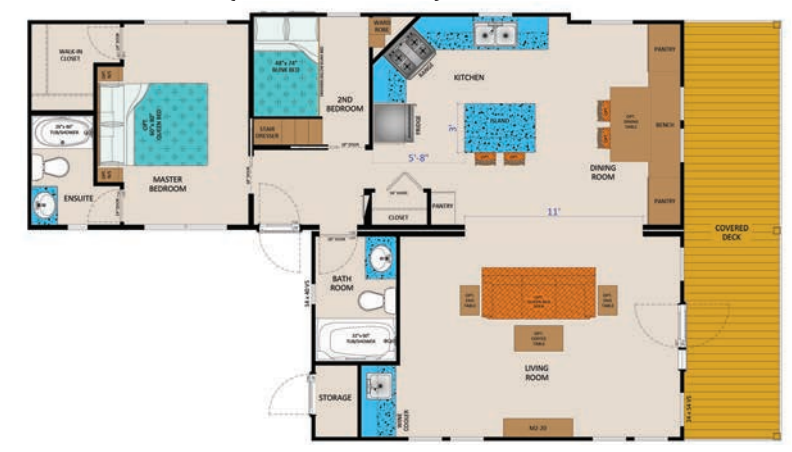
Monaco - 20 (M4113 3BR FL) 539 SQ.FT. + 296.8 SQ.FT.