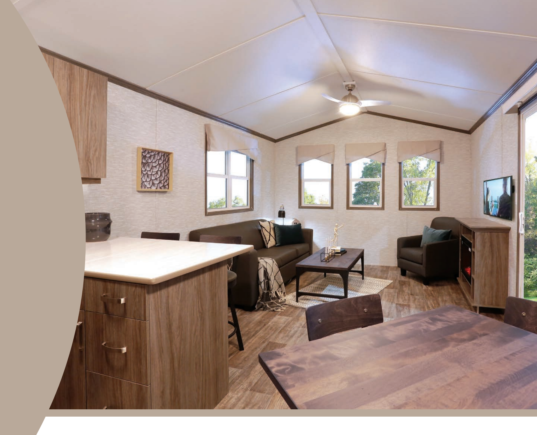
Frontier – Noun Unchartered territory beyond which lies wilderness.