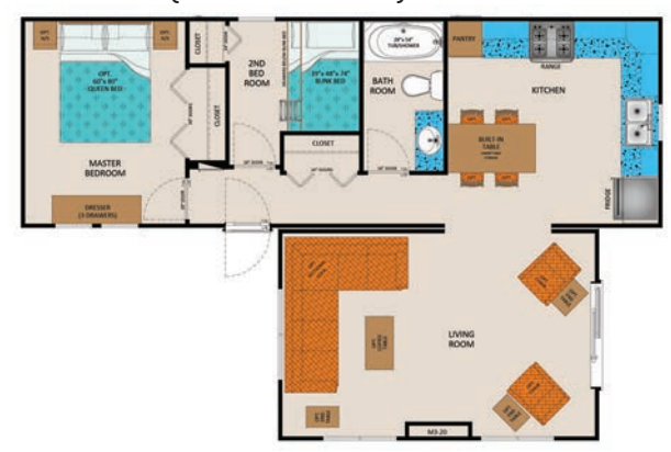
Muskoka - 20 (F3612 2BR FK) 426 SQ.FT. + 213 SQ.FT.