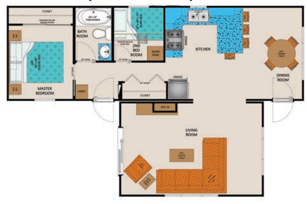
Maidstone - 20 (F3712 2BR FD) 438 SQ.FT. + 213 SQ.FT.