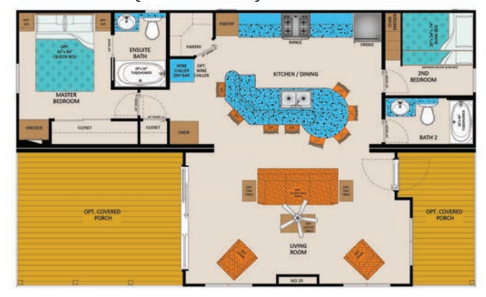
Minaki - 20 (M4012 2BR) 474 SQ.FT. + 237 SQ.FT.