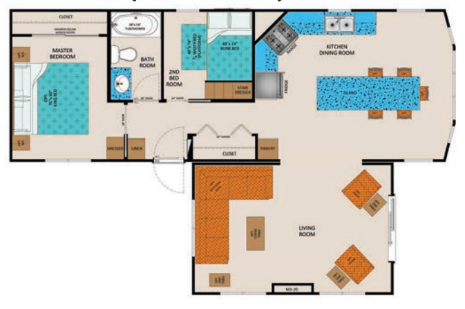
Marabella - 20 (M3914 2BR FL) 538 SQ.FT. + 213 SQ.FT.