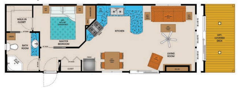
Revelstoke - 20 (R3914 2BR FLD) 538.6 SQ.FT.