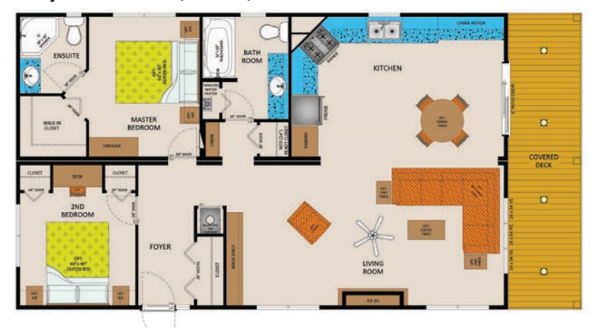
Rosedale - 20 (R3914 2BR FL) 540 SQ.FT.